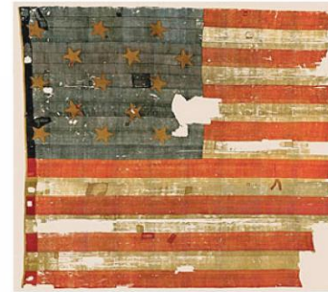
The Star-Spangled Banner at the Smithsonian Institution in Washington, D.C.